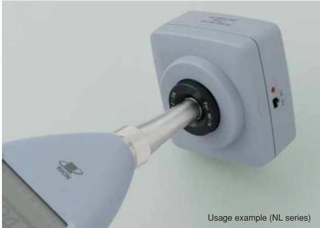
Usage example (NL series)

Carefully insert the microphone all the way into the coupler of the NC-74. Then simply turn the power on to apply a constant sound pressure level to the diaphragm of the microphone.